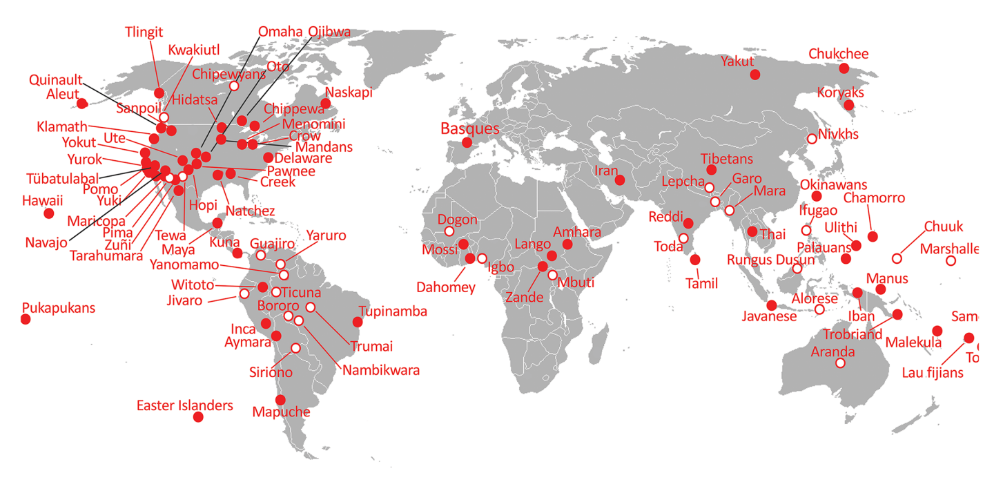
Fig 1. Geographic distribution of the sampled societies (using the EA to assess the level of stratification). Full circles: societies with MHP; empty circles: societies without MHP.